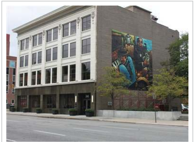
Arts Council of Indianapolis The “Pennway” mural, by artist Erik Pearson, is one of 46 commissioned by the city of Indianapolis.

Supporters hope to complete the project by late November; until then, visitors should head to the Central Canal, north of downtown, where a mile-long stretch of wall is expected to feature 10 completed pieces by the end of this month.