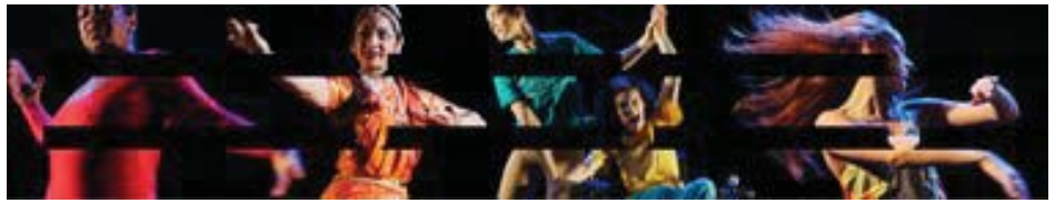
A segment of the 85,000-square-foot mural, “How Philly Moves.”

“It comes down to how we define public space,” she said, likening today’s muralists to the artists of the Depression-era WPA . “That outpouring of creativity, imagination and community support manifests itself on walls throughout a city.”